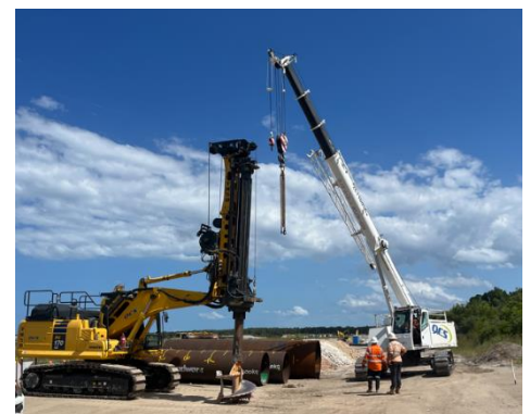
Works underway to establish the foundations for the power poles.